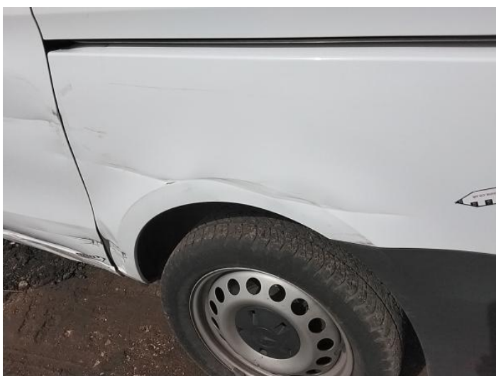
5: Qtr Panel nsr Dented Over 30mm