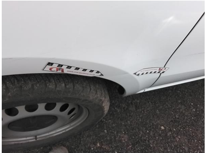
10: Qtr Panel osr Dented Over 30mm