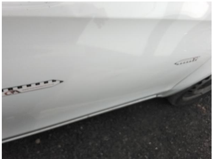
12: Door osf Dented Over 30mm