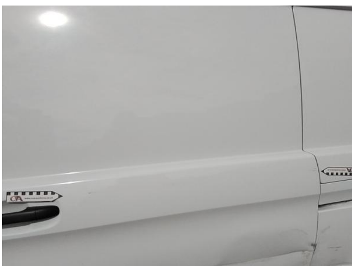
7: Qtr Panel nsr Scratched Over 25mm Not Thru Paint