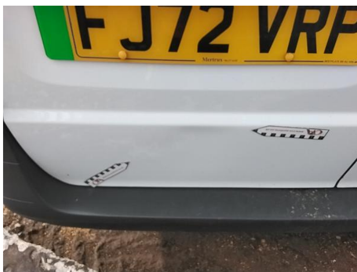
8: Door nsr Dented Over 30mm