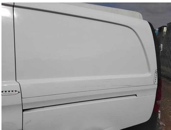
6: Qtr Panel nsr Scratched Over 25mm Not Thru Paint