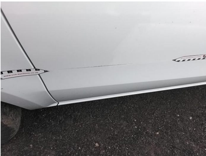
11: Qtr Panel osr Scratched Over 25mm Not Thru Paint