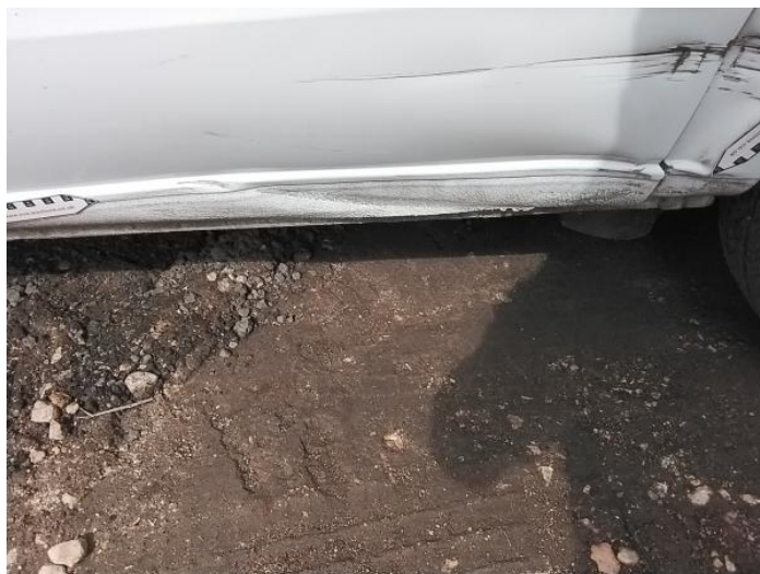
4: Sill ns Dented Over 30mm