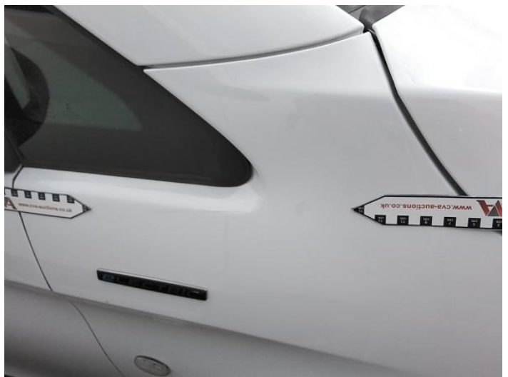
14: Wing osf Scratched Over 25mm Not Thru Paint