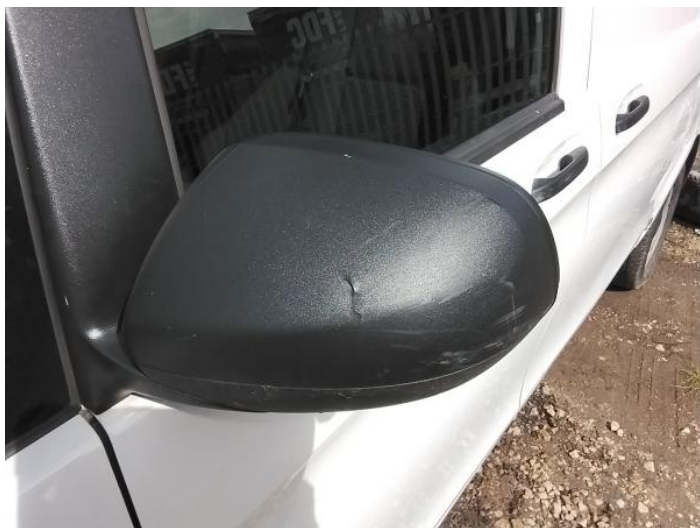
1: Door Mirror Assy nsf Broken Replace