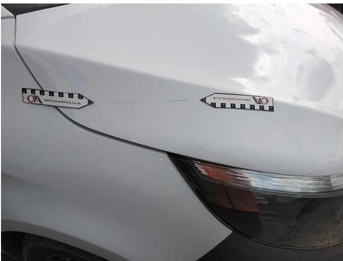
13: Bonnet Scratched Over 25mm Not Thru Paint