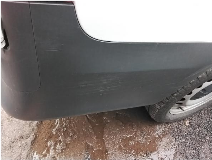
9: Bumper Rear Moulding Scuffed (Unpainted) Over 100mm