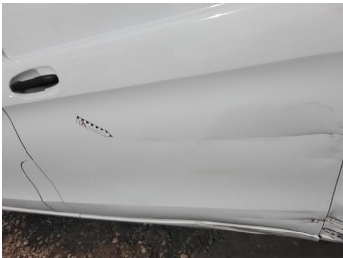
3: Qtr Panel nsr Dented Over 30mm