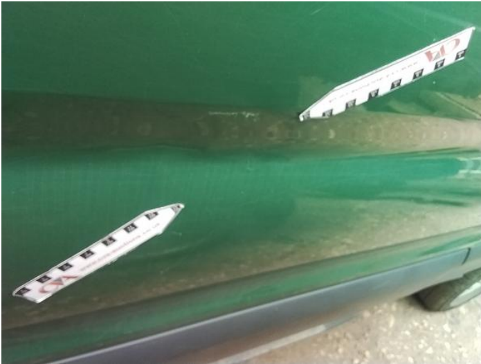
9: Qtr Panel nsr Dented Over 30mm