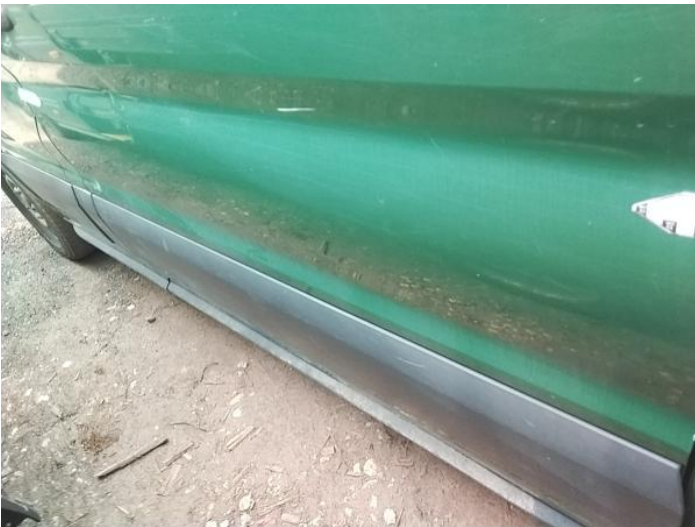
8: Qtr Panel nsr Scratched Over 25mm Thru Paint