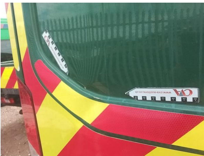
13: Door nsr Dented With Paint Damage