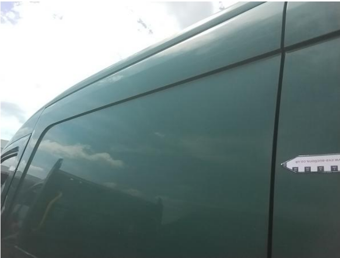
6: Qtr Panel nsr Scratched Over 25mm Not Thru Paint