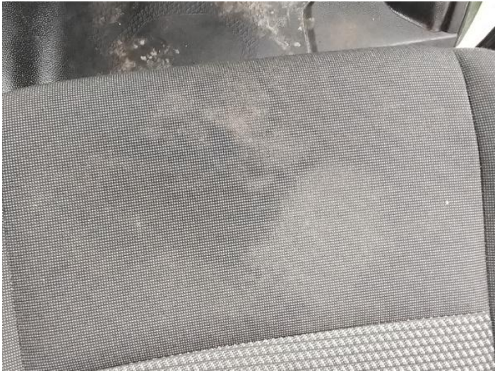
22: Seat Base Cover osf Soiled Heavy