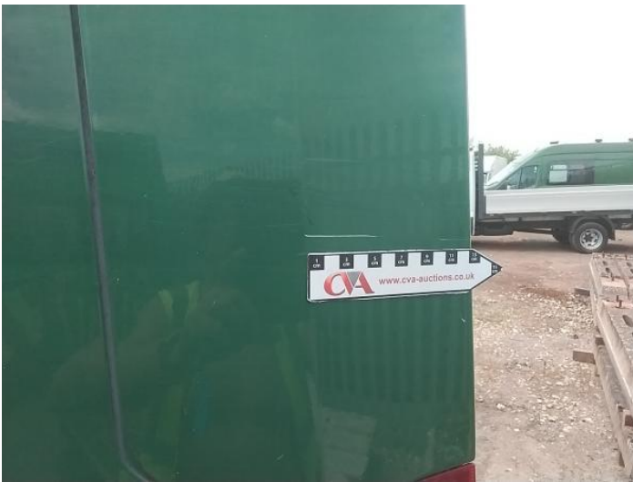
11: C Post ns Scratched Over 25mm Thru Paint