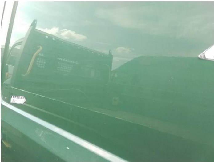
7: Qtr Panel nsr Scratched Over 25mm Thru Paint