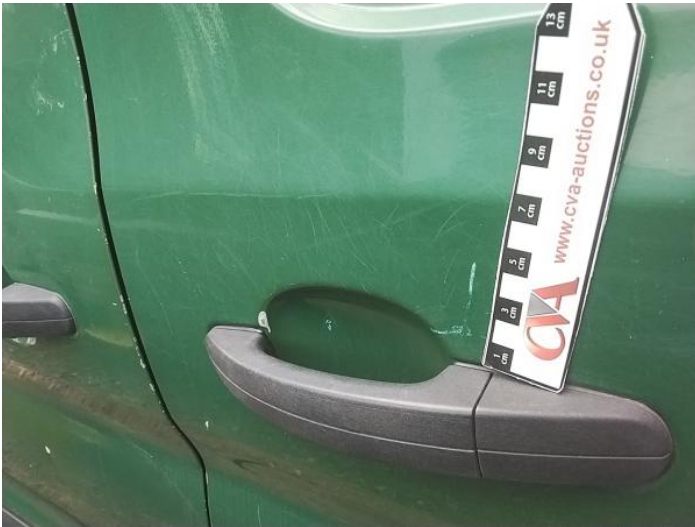
5: Qtr Panel nsr Scratched Over 25mm Thru Paint