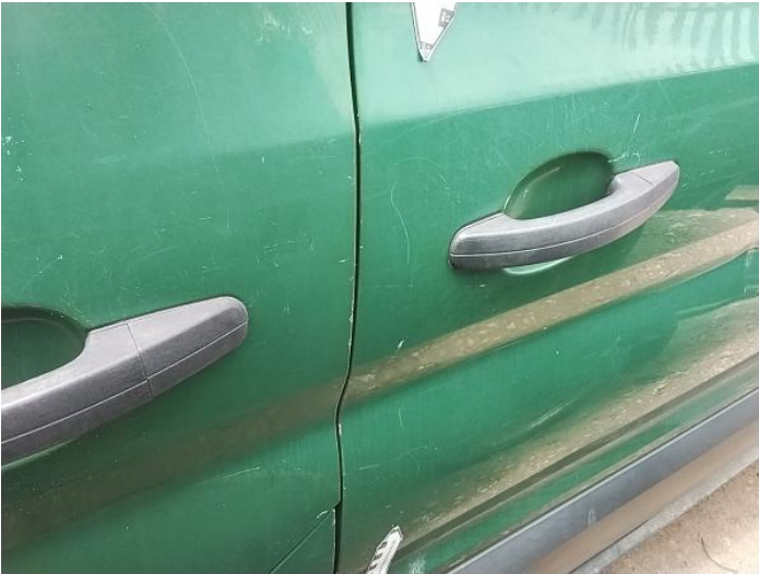
4: Qtr Panel nsr Scratched Over 25mm Thru Paint